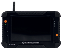
5" Monitor Art. No. 1057