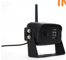
Camera Art. No. 1045